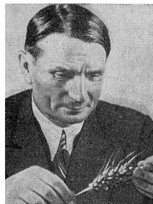
Fig. 4: Lysenko in 12 th grade textbook (1925)