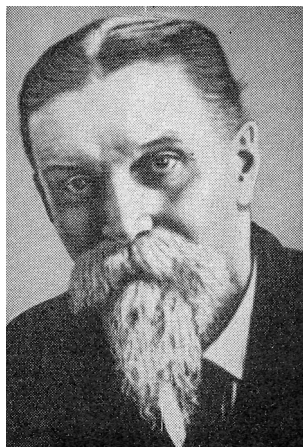
Fig. 2: Timiryazev in 12 th grade textbook (1952)